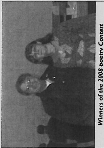
Winners of the 2008 poetry Contest